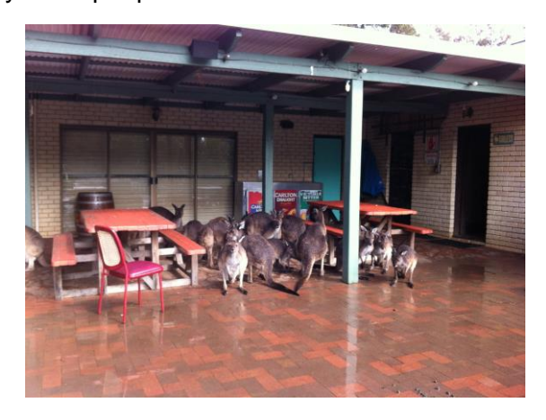
Kangaroos waiting for a feed.

Feeding brings kangaroos and wallabies into close contact with people and possible conflict. Aggressive animals within the mob can pose a danger to people, especially families with young children. Losing their fear for humans may also make kangaroos and wallabies more vulnerable to abuse by other people.